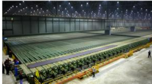
Cooling Bed for Steel Products